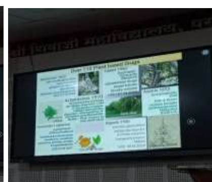
Role of Women Scientist in Viksit Bharat through Research